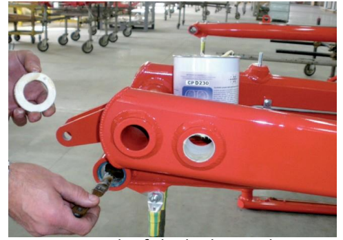
Pantograph of the high speed train "Freccia Rossa" (Italy)

After undergoing strict bench testing and thorough trials on duty, some of our products have been approved for the use within basic and higher level maintenance steps. Our focused aim is to supply products able to improve the reliability of rolling stocks and to save maintenance time and costs.